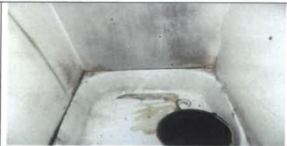
Fig 10.0 View showing rusty corrugated sheets to be remove and replace with new. External roofing.