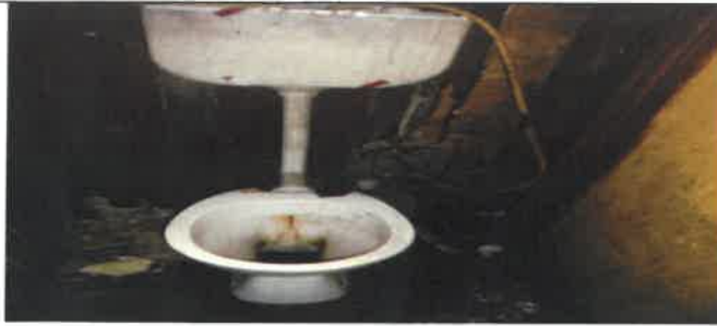
Fig 9.0 View showing faulty Toilet pot, cistern to be remove and replace with new. Toilet room.