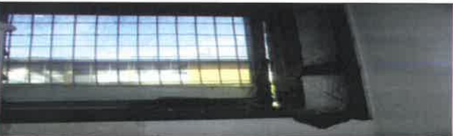
Fig 15.0 View showing wore insect screen to be remove and replace with new.