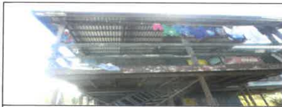
Fig 1.0 View showing Back view of the house. External