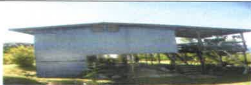
Fig 5.00 View showing external view of the building.