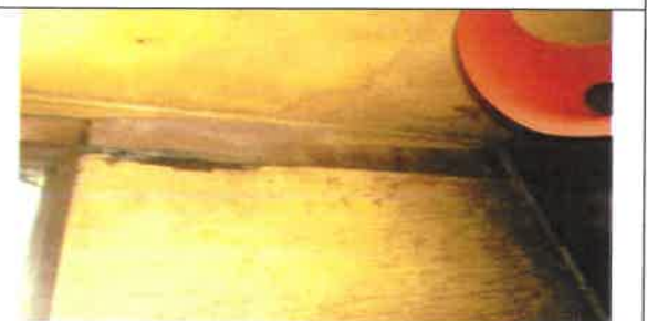
Fig 18.0 View showing rotten wall cladding to be remove and replace with new.