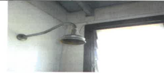
Fig 11.0 View showing rusty rose to be removed and replace with new. Bathroom.