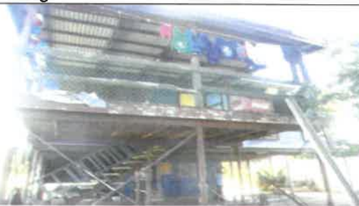
Fig 7.0 View showing verandah to be constructed with new verandah rails.