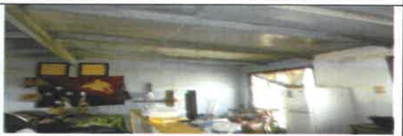
Fig 16. 0 View showing rotten kitchen frame to be remove and replace with new.