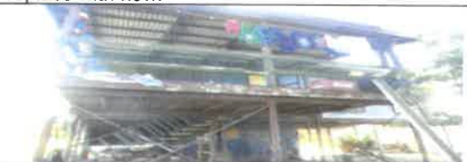
Fig 6.0 View showing external view of the building continues.