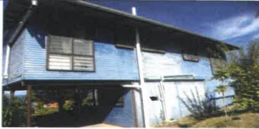
Fig 3.0 View showing Back view continue.