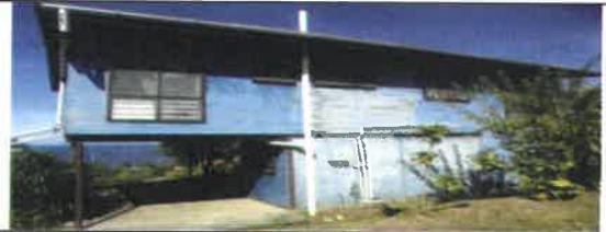
Fig 2.0 View showing external view.