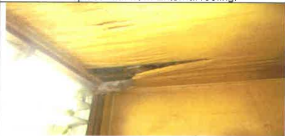
Fig 12.0 View showing rotten ceiling lining to be remove and replace with new. Kitchen