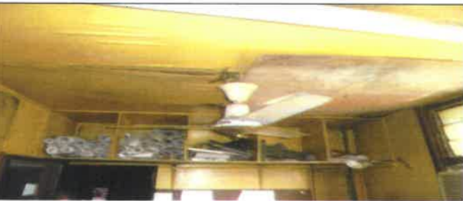
Fig 17.0 View showing faulty fan to be remove and replace with new. Kitchen area.