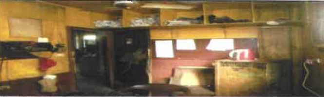
Fig 13.0 View showing Kitchen area.