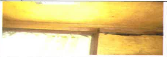
Fig 14. 0 View showing Internal wall to be painted.