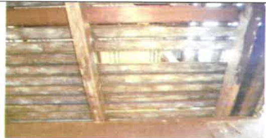
Fig 8.0 View showing rotten flooring to be remove and replace with new.